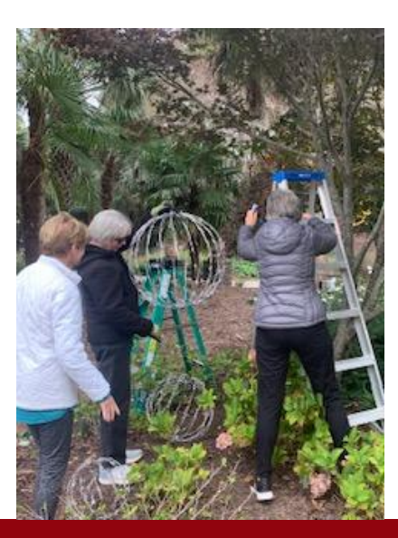
Azalea Garden Tour 2023