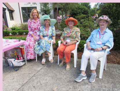
More on her Facebook page from the Ribbon Cutting

Ladies Lunching RSVP to Sahardee@ec.rr.com