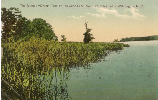
The famous "Dram" Tree on the Cape Fear River, two miles below Wilmington, N. C.