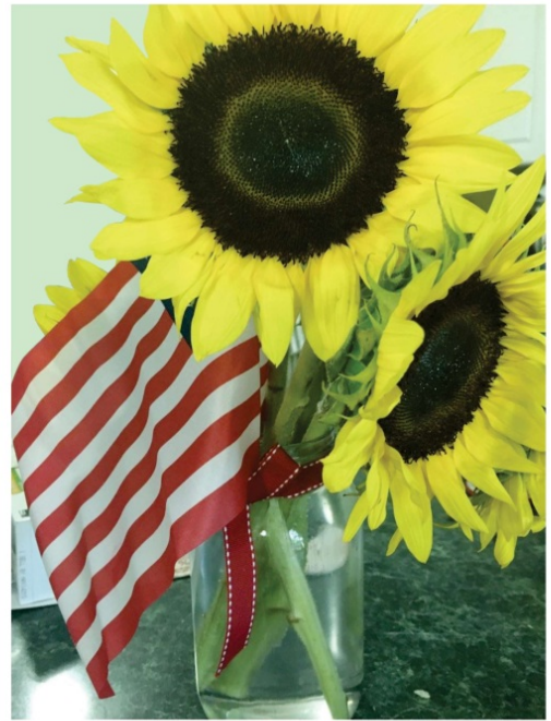
'Plant a Seed' Cape Fear Garden Club Wilmington, N.C. 2021—2022

If you were not able to come to the "Drive-By", please bring your check to the September meeting or mail your check to our treasurer: