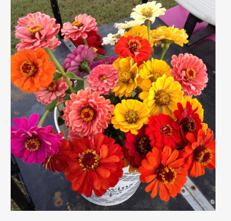
Zinnias from the Day at the Henry Farm