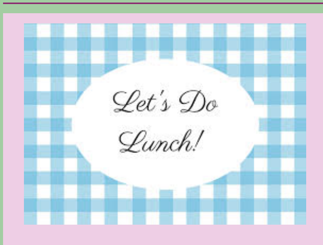
Let's Do Lunch!

More information at the General Meeting.