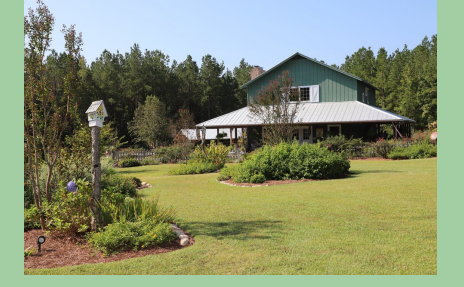
Plant Giveaway Was Very Popular