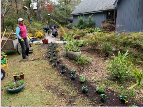
Work day at Garden #2