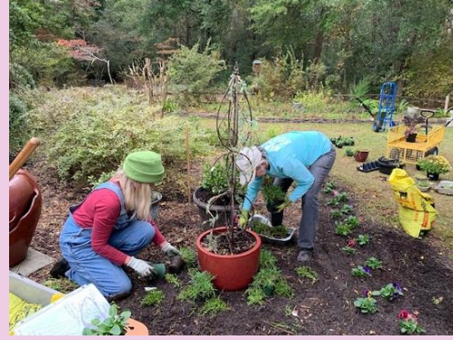
Cold day for planting garden #2