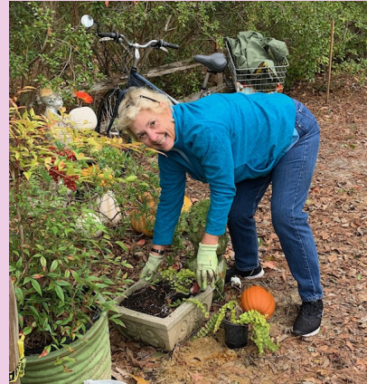
Lots of helping hands Garden #2