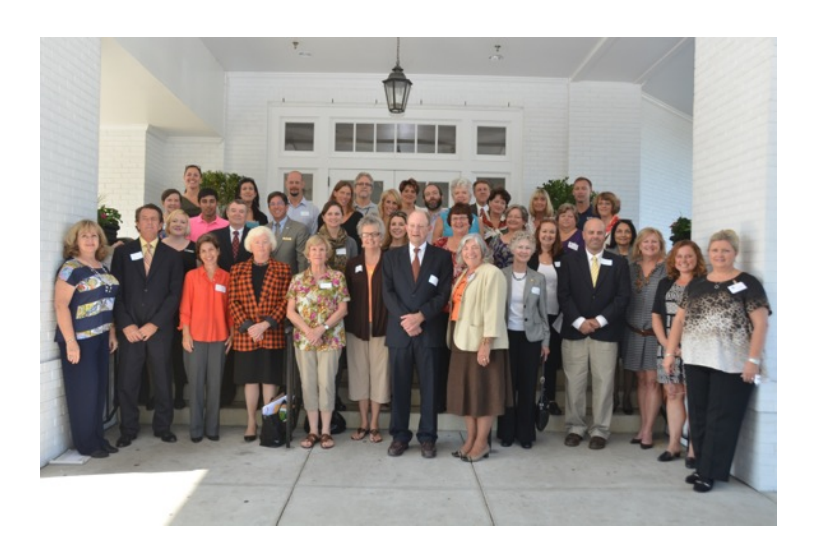
2014 Garden Tour Grant Recipients