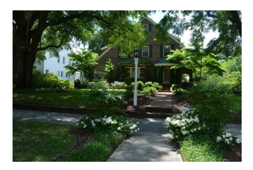
Residential - 304 Live Oak Parkway