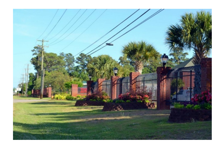
Monkey Junction Self Storage Business