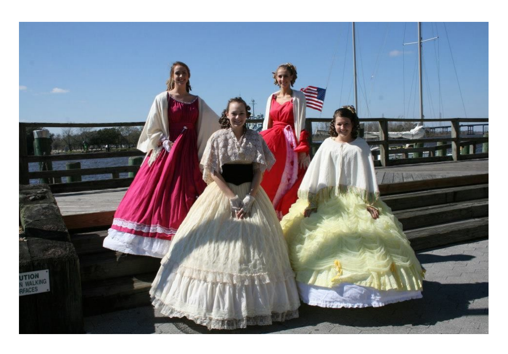
Azalea Belles downtown on "Be a Tourist in Your Own Hometown" day - March 3, 2013

***Just one idea of a recipe to use for ribbon cutting cookies. You can also consult our Christmas Tea cookbook for more ideas. Remember no nuts and no chocolate!