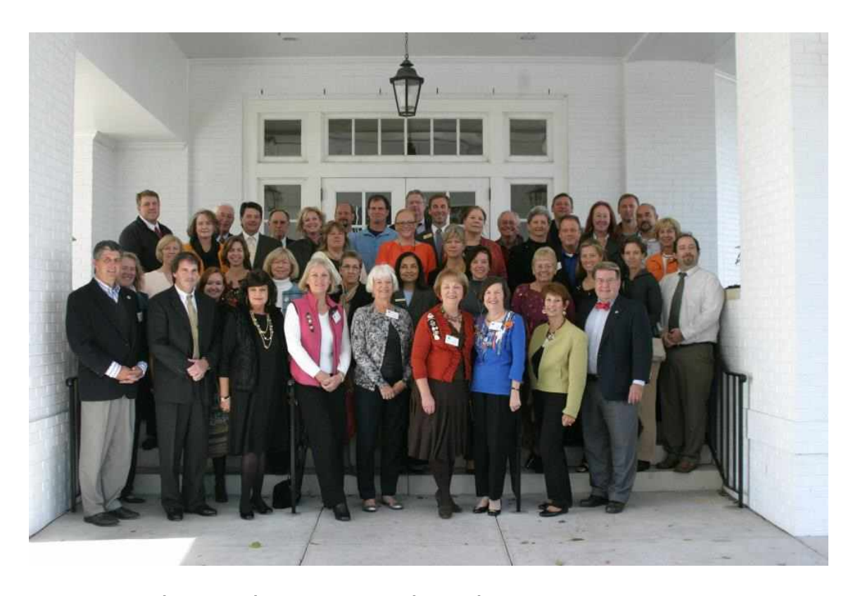
Azalea Garden Tour Funds Disbursement Committee Awards Meeting, October 30, 2012 18 Grant Recipient Organizations and Grant Committee Members